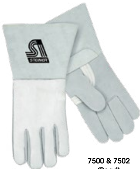
7500 & 7502 (Pearl)

Grain elkskin offers the best dexterity and comfort, and remains supple after exposure to heat. Choice of Nomex® or ThermoCore™ foam lined back to insulate hands from heat