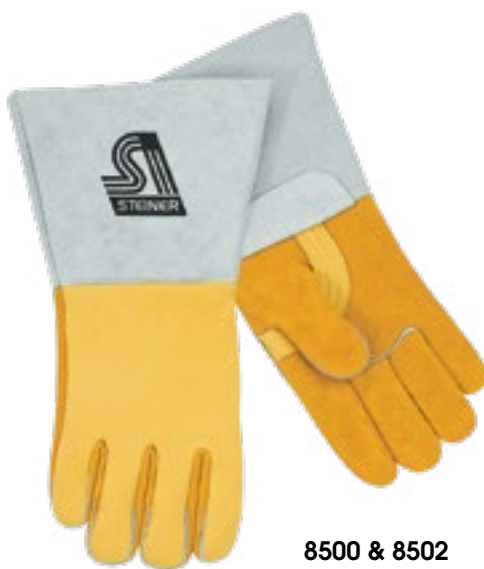
8500 & 8502 (Gold)